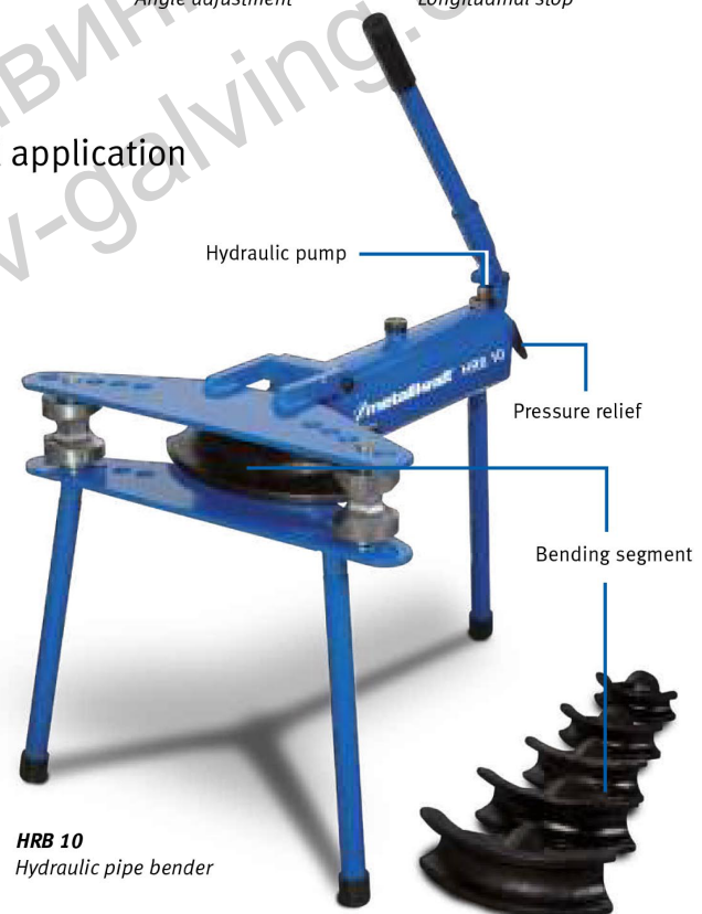
HRB 10 Hydraulic pipe bender